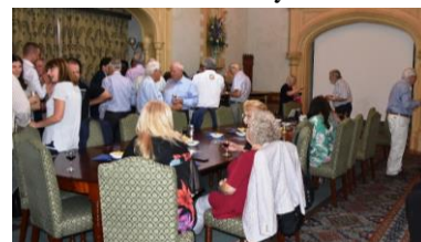
The assembled multitude (53 actually)